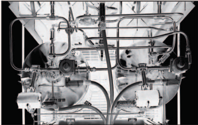
SIMPLIFIED STAINLESS STEEL PLUMBING (top view)